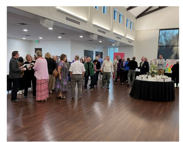
The empty seat was for you!